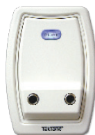
patient station, dual 1/4" jacks