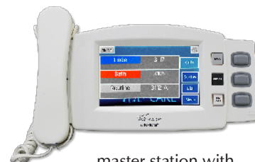
master station with handset and desk mount housing