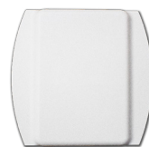
auxiliary input module provides 2 inputs capable of monitoring devices such as door contacts, security panel outputs, etc.