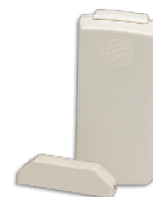
universal contact transmitters