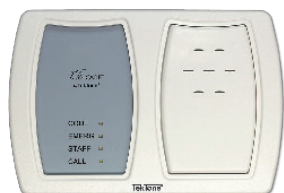
duty station with tone speaker