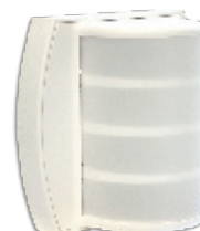
room controller with dome light, 2 LED colors (shown off and on)