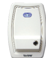
patient station, single 1/4" jack