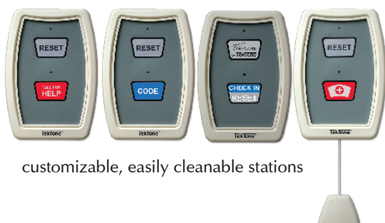
customizable, easily cleanable stations