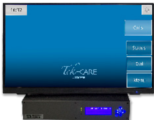
Tek-CARE Appliance Server