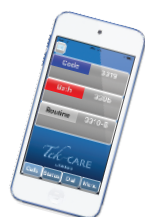
Tek-CARE Staff App for iPhone, iPad, iPod touch and Android devices, and Tek-CARE App for Apple TV®