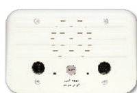
patient station, single or dual DIN jacks