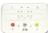
staff station with emergency call button