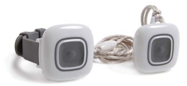
Figure 4 The Inovonics EN1221S-60 family of senior living pendants.