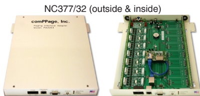
NC377/32 (outside & inside)

The PK250B Uninterruptible Power Supply (UPS) provides short-term backup power to the Tek-CARE Appliance Server during the switch over to emergency power.