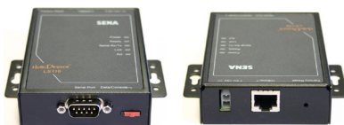
CT601 (front & back)

Dimensions: 14"×10"×1.5" (356 mm × 254 mm × 38 mm)