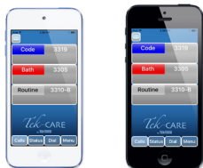
LS621-series Tek-CARE Staff App shown on iPod touch and iPhone