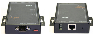
CT601 (front & back)

Dimensions: 14"×10"×1.5" (356 mm × 254 mm × 38 mm)