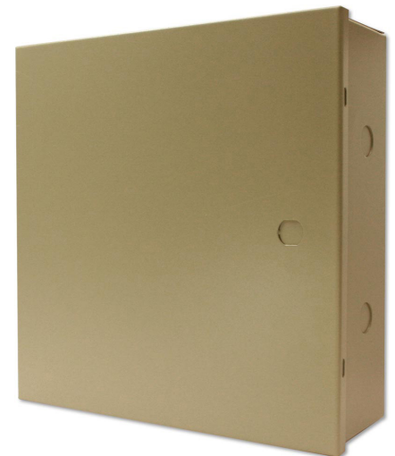
PK124K Battery Backup Kit