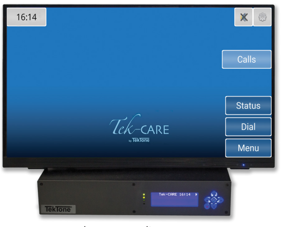
Tek-CARE Appliance Server (NC475DESK pictured)