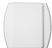
auxiliary input module