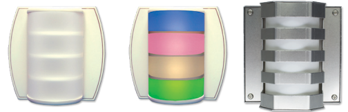
corridor light with 4 programmable-color LEDs, and optional vandal-resistant dome cover (plug-on zone light module also available)