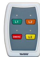
4-button staff peripheral station