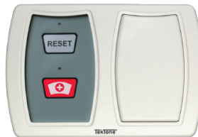
dry contact output module