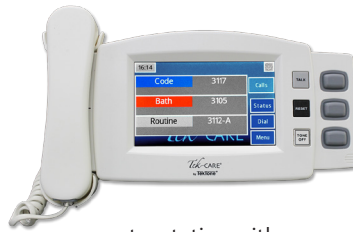
master station with handset and desk mount housing