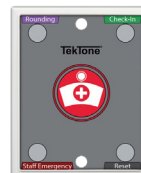
single bed multifunction station