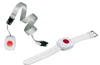
pendant transmitter with wrist band option