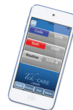
Tek-CARE® Staff App for iPhone, iPad, iPod touch and Apple TV® and Android devices