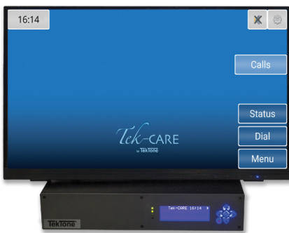
Tek-CARE® Appliance Server with Tek-CARE® Reporting Software