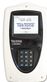
keypad with display