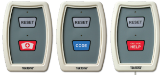
customizable 2-button pull-cord stations