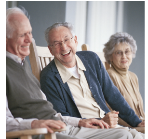
ASSISTED / INDEPENDENT LIVING