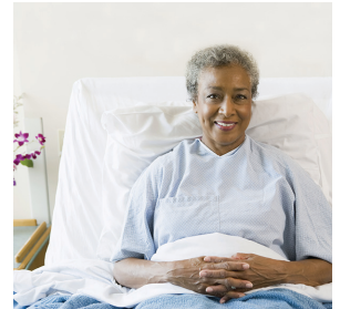
AMBULATORY SURGERY CENTERS