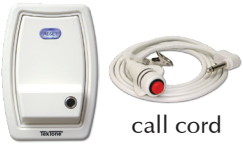
single room station