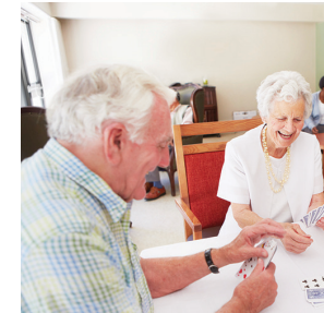
CONTINUING CARE RETIREMENT COMMUNITIES / LIFE PLAN