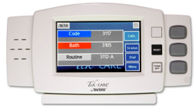
touchscreen master station, wall and desk mount options