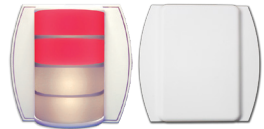
station controllers with & without dome light

is a two-wire nurse call system designed for easy installation often allowing re-use of existing wire for retrofits.