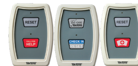
customizable 2-button pull-cord station