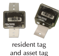
resident tag and asset tag