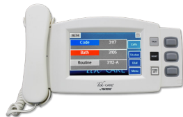
touchscreen master station, with optional handset kit

The Tek-CARE®160 is a modern and affordable nurse call system that is easy to install, use, and maintain. Featuring customizable peripheral