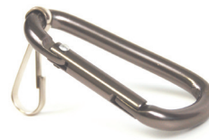
Belt loop kit for neck lanyard pendant