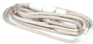
Replacement neck lanyard