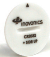
Replacement battery door