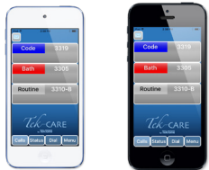
LS621-series Tek-CARE Mobile iOS App shown on iPod touch and iPhone