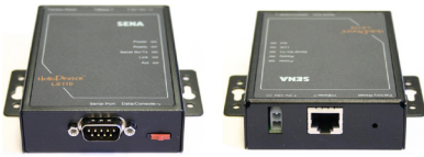
CT601 (front & back)

Dimensions: 14"×10"×1.5" (356 mm × 254 mm × 38 mm)