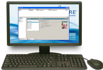
NC474 with LSMON-series Event Monitor

Monitored systems must be able to supply an accessible data stream via one of the following protocols: Serial (event printing, Scope paging, ContactID), COMPII, TAP, NC300/NC300 II, HL7, TCP/IP, TCP/IP Listener, or UDP. Each monitored system connects either to one of the four unused serial ports, or to the facility's LAN using a CT601 Serial to IP Converter.