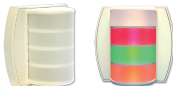
corridor dome light