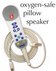
oxygen-safe pillow speaker