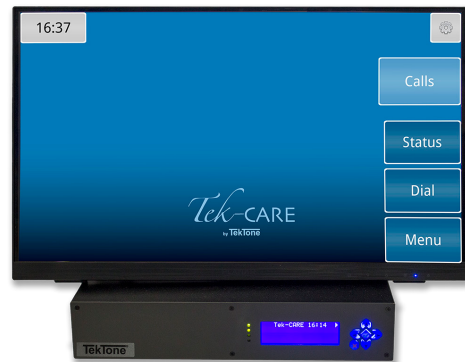
Tek-CARE Appliance Server with Tek-CARE300II and Tek-CARE500 software, plus Event Monitor and Reporting software modules