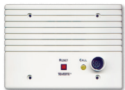
single bed station