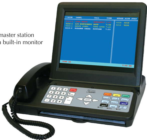
master station with built-in monitor