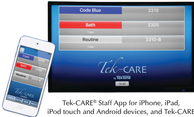
Tek-CARE® Staff App for iPhone, iPad, iPod touch and Android devices, and Tek-CARE App for Apple TV®