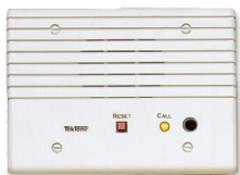
single bed stations with audio

Tek-CARE® NC110 nurse call system provides audible and visual call indication without intercom communications. The NC110 master annunciator station has lights for each remote station, may be used as a remote annunciator for NC150 systems, and may be wall- or desk-mounted. The small, desk-mounted NC110A master annunciator has LEDs for each remote station, and is water-resistant.