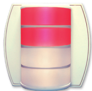
LED corridor light