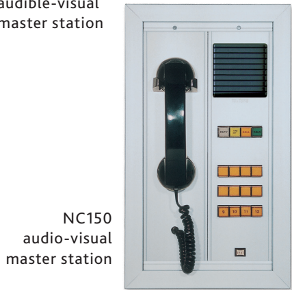
NC150 audio-visual master station

NC150 and NC110 master stations are modular for custom configuration, while the NC110A master station accommodates up to 50 remote stations. Three call levels allow for routine, emergency, and code or fire indications. All Tek-CARE® systems are UL® 1069 listed.